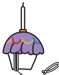
Secure loops with straight pins.

13. Snip off the bottom of the skewer flush with the felt base.