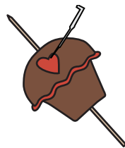
Shape heart with needle.